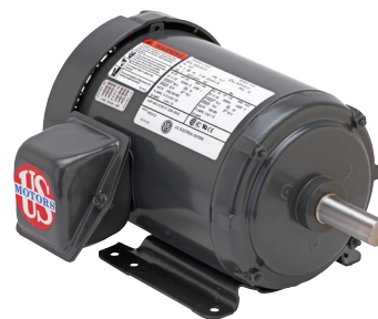
UNIMOUNT® Motors Footed