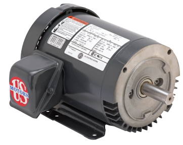
UNIMOUNT® Motors C-Face Footed